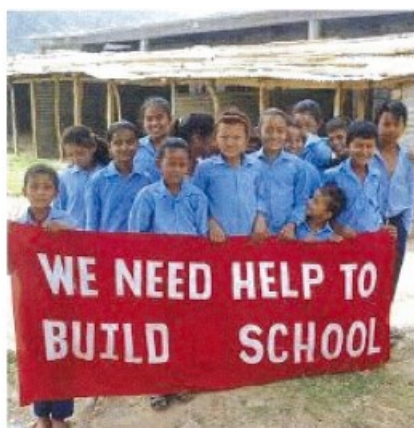
DHAREPANI SCHOOL FUNDRAISER